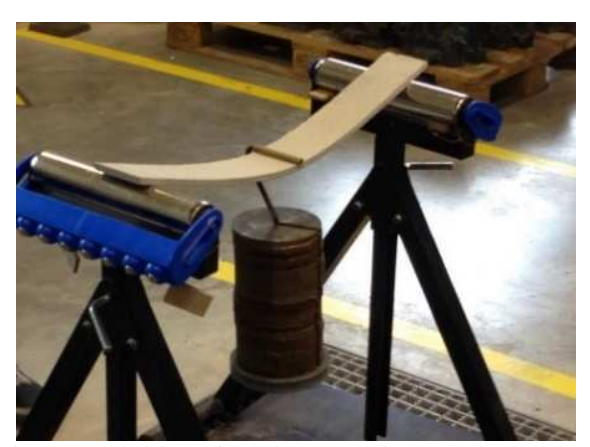
Figure 2. Demonstration of the possibility of textile – reinforced concrete under impact bending load.

Due to the combination of the properties of concrete and textile net, the composite has unique features that underline its exceptional feature. Due to the high tensile strength of carbon fibers and alkali-resistant AR-glass fibers, from which the net is woven, textile-concrete becomes practically a "flexible" material (Fig. 2).