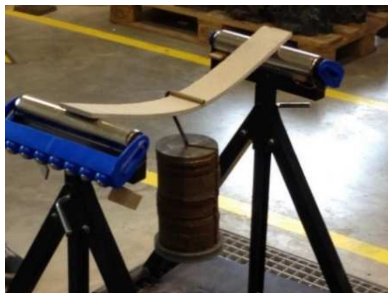
Figure 2. Demonstration of the possibility of textile – reinforced concrete under impact bending load.

Due to the combination of the properties of concrete and textile net, the composite has unique features that underline its exceptional feature. Due to the high tensile strength of carbon fibers and alkali-resistant AR-glass fibers, from which the net is woven, textile-concrete becomes practically a "flexible" material (Fig. 2).